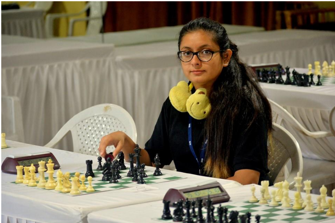
Figure: Chess competition