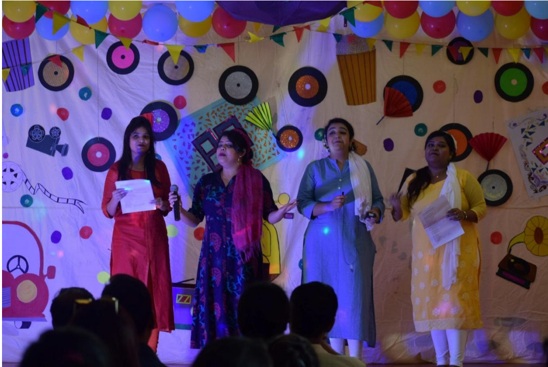
Figure: Group singing