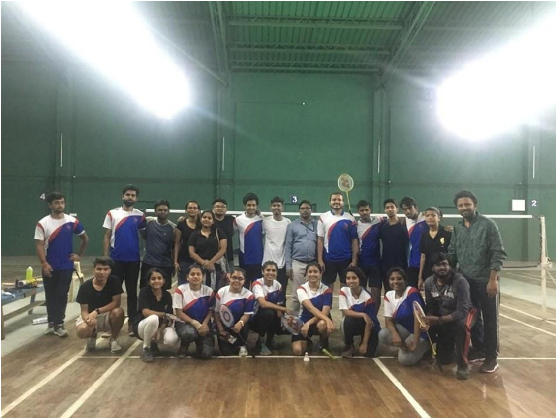
Figure: Badminton tournament