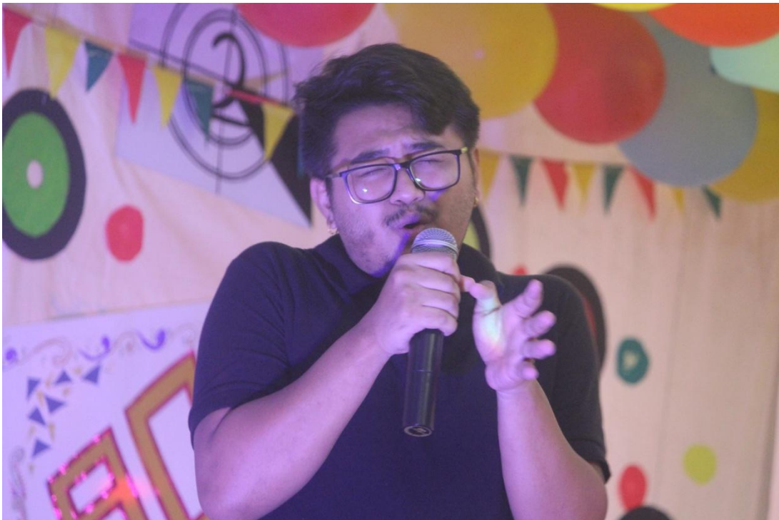
Figure: Solo Singing