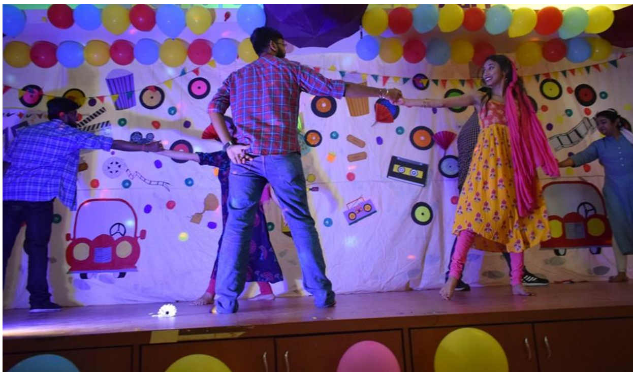
Figure: Group dance