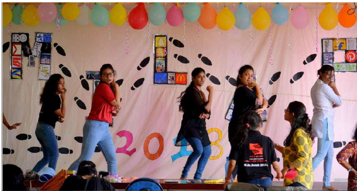
Figure: Group dance